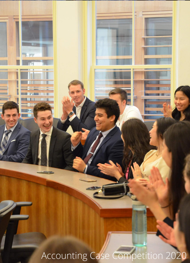
Accounting Case Competition 2020