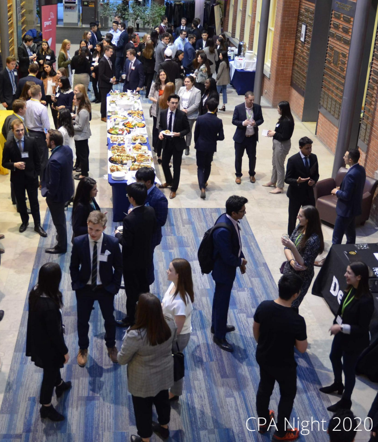
CPA Night 2020

By partnering with QAA, you immediately gain access to a talented base of students eager to pursue opportunities in the accounting profession. The Industry Liaison Team would be delighted to speak with you about any of the events discussed below and how a strategic partnership with QAA can help advance your firm on campus at Queen's University.